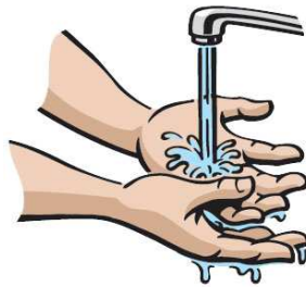
4. Rinse Hands