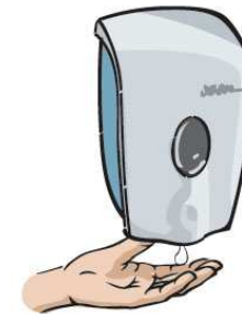
6. Dispense one measure of Alcohol Gel