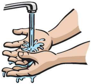
1. Wet Hands