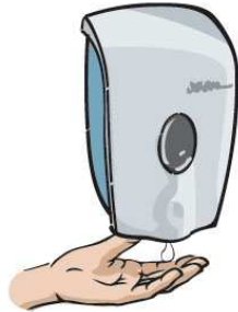
2. Dispense one measure of soap