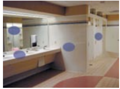
Blue MicroQuick™/MC Cloth Applications

For General Cleaning: Lightly spray the recommended product onto the microfiber cloth and wipe the surface clean. For stubborn soil, spray additional product onto the surface and wipe dry.