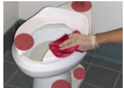
Red MicroQuick™/MC Cloth Applications