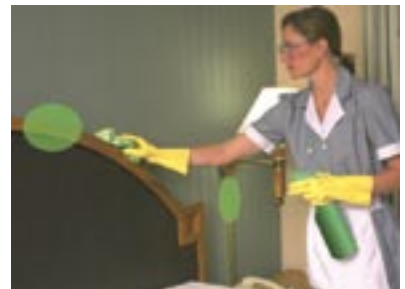
Green MicroQuick™/MC Cloth Applications

Please make sure you and your employees read and understand the product instruction sheets before using this product. Follow label use directions and precautions for each individual product.